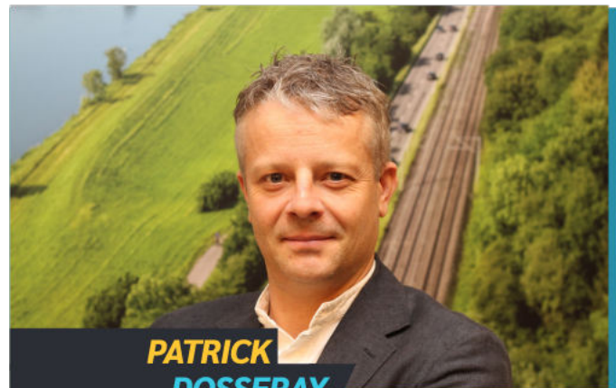
Präsident CSV Mäertert-Waasserbëlleeg

A lot can be done in the community: Even in opposition: we are pleased that the Board of Aldermen has also taken up our ideas, such as the introduction of 20 zones in residential areas or the establishment of a bicycle washing station.